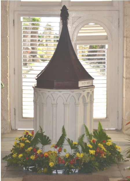
The Marble and Mahogany Font of 1684