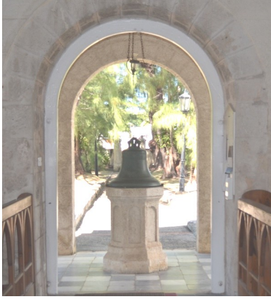
Our Historic Bell of 1696