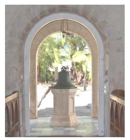
Our Historic Bell of 1696